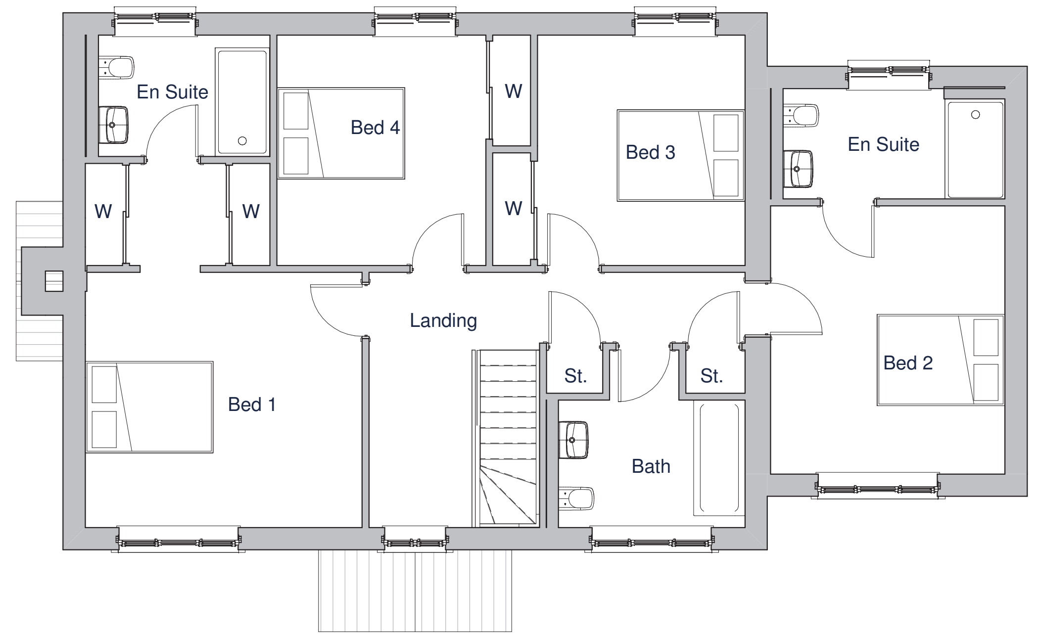
2 1.1 First Floor 1 : 50