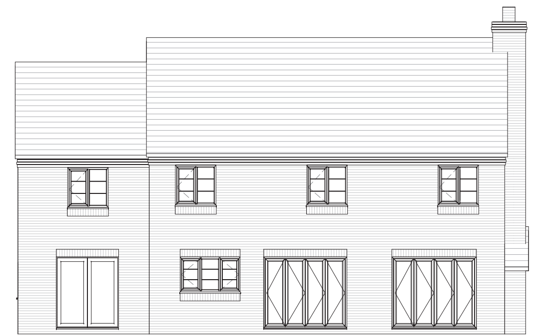
4 Rear Elevation 1 : 100