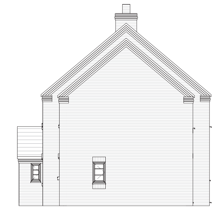
5 Side Elevation 1 : 100