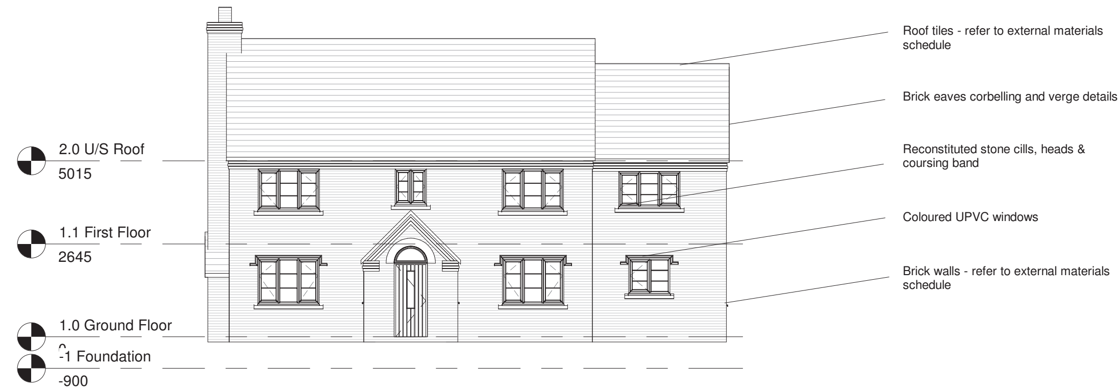
3 Front Elevation 1 : 100